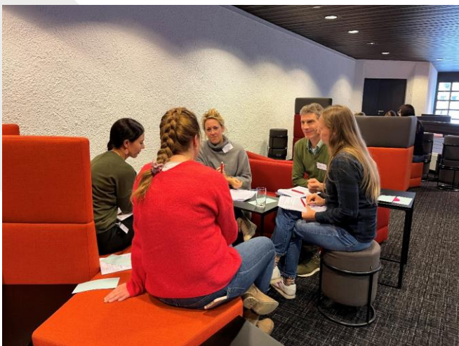
Working group on assignment in the workshop “Mental illness as a challenge in return counselling”.

The next in-person workshop in Augsburg, Germany, will take place on 5.-7. November 2024. The topic of the workshop is Voluntary return to the Russian Federation. More information and the chance to apply for it will follow in July 2024.